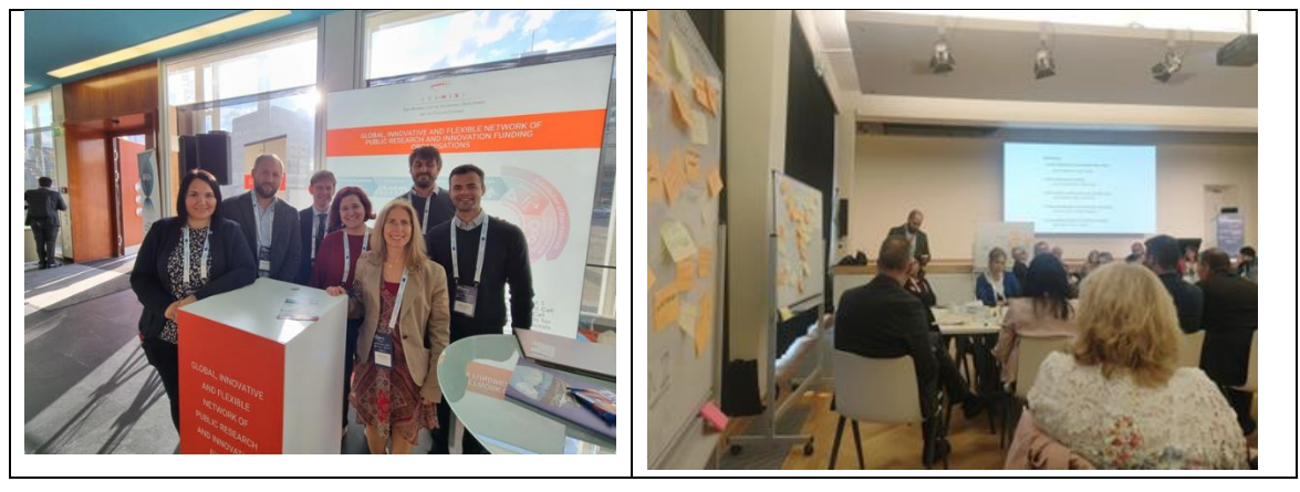
Figure 1 — ERA-MIN workshop group discussions (photo on right side); ERA-MIN Team at the ERA-MIN booth during RawMaterials Summit (left side).